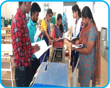
CONCRETE & HIGHWAY ENGINEERING LAB