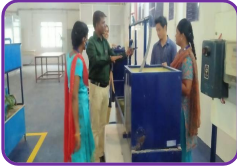
HYDRAULIC ENGINEERING LAB