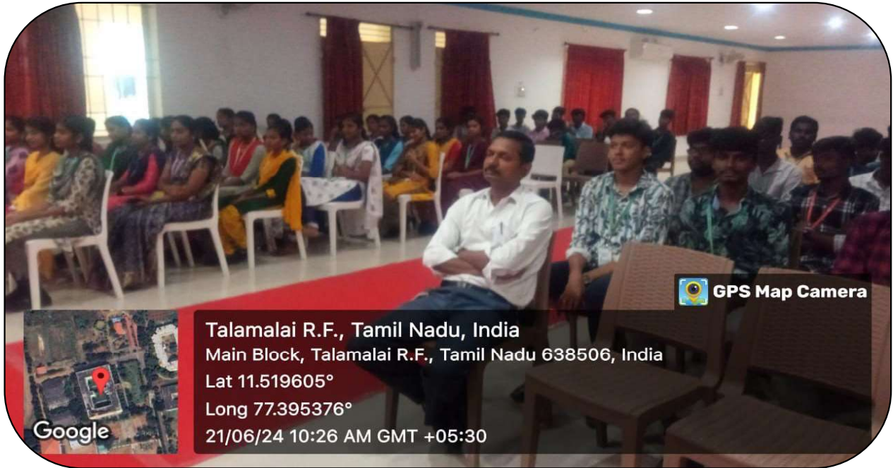
Participants from II Years, III years and IV Years students